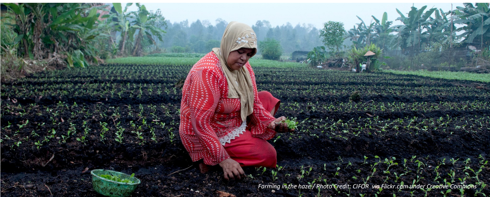
Farming in the haze